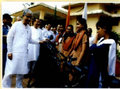
Honourable Chief Minister of Tripura distributes bi-cycles to minority girl students

A scheme of distributing bi-cycles among minority girl students has been set afoot from 2012-2013 to facilitate encouragement among them. 300 girl students of the community were given free bi-cycles accordingly.