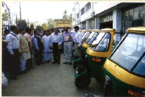
Auto-rickshaw distribution by Tripura Minority Cooperative Development Corporation

The Tripura Minority Cooperative Development Corporation Ltd. was formed in 1997. The Corporation currently financial assistance by granting loan to youths from the minority community at easy installment conditions for any form of trade or transport business. Besides, it also grants education loans to students from the minority community studying in higher education in technical trades. The Corporation has adopted the plan of granting loan to 500 youths from minority community in the current financial year (2013-2014). 501 youths were benefitted by the scheme from 2007-2008 to 2011-2012 through loans for different trades. 350 were benefitted in 2012-2013. The Corporation has also given education loans to 173 students from the minority community till date.